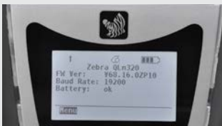
Easy-to-read display with larger, higher-resolution screen