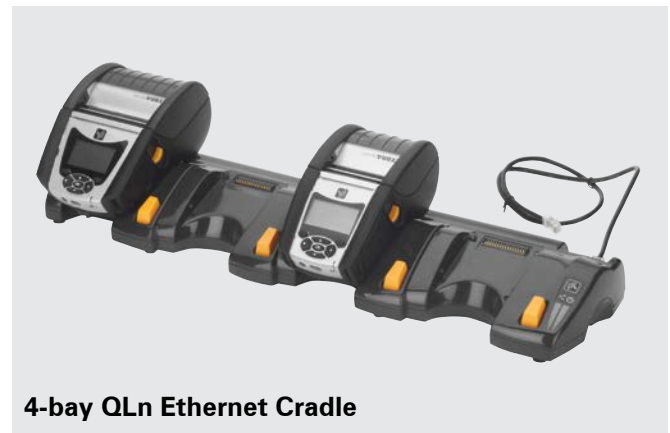
4-bay QLn Ethernet Cradle