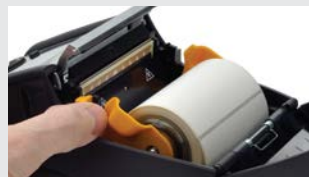
Intuitive peeler operation