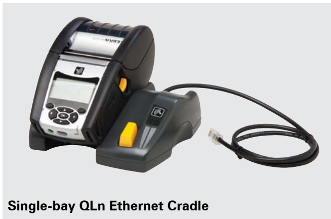
Single-bay QLn Ethernet Cradle