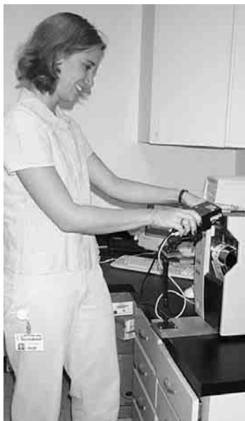
An on-demand print setup means each "tissue in process" is assigned a bar code once it is procured from inventory.